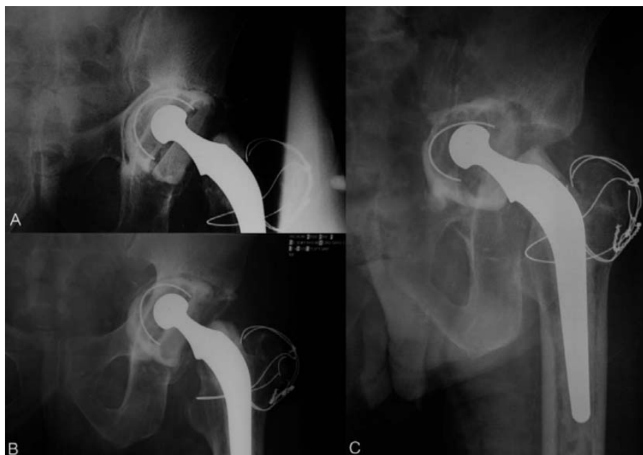
Figure 2. A: Radiograph at eight years after index operation demonstrates complete \geq 2 mm radiolucency line in all zones of acetabulum. B: Radiograph at 10 years after index operation. There was a medial protrusion of both acetabular component and cemented mantle with eccentric polyethylene wear. Although the pelvic discontinuity had developed, the superior and inferior acetabular bone losses were much less severe. C: Radiograph at 11 years after index operation demonstrates extensive medial protrusion of acetabular wall into pelvic cavity with minimal superior bone-loss. When the infection has been presented for such a prolonged duration, the medial acetabular bone-loss became massive.

Both cases demonstrated two similar atypical radiographic findings. These included 1) migration of the cup towards the medial wall with no reactive bone surrounding the cup resulting in pelvic discontinuity, 2) minimal bone destruction in both superior and inferior acetabulum. In fact, these two findings are not common in aseptic loosening of cemented acetabular component, or septic loosening. Patients usually have surgical management before the condition develops at such a late stage.