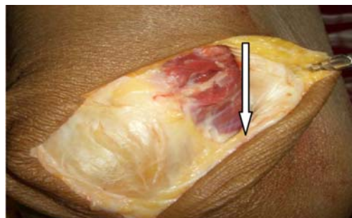
Fig. 1 Dissected descending genicular artery (arrow) of right fresh cadaver knee

The medial parapatellar has been the most frequently used and the satisfied approach for TKA. Although it was an appropriate approach for TKA, it might disrupt the medial patellar blood flow and the extensor mechanism (11,12) . The subvastus is a quadriceps-sparing approach, which releases the vastus medialis along an intramuscular plane and does not violate the extensor mechanism. However, it might be the limited exposure in the obese and the prominent vastus medialis patients (13) . The midvastus approach made a compromise between the increasing of exposure (medial parapatellar) and the minimizing of the disruption of the extensor mechanism (subvastus